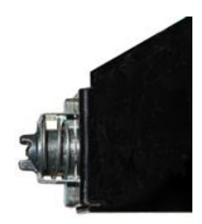
PANLOC twist button