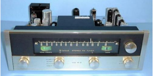
MR 65 - Sold from November 1960 - April 1962. S/N: 1R001~1R979 & 100F1~131F7 (1,530 UNITS)

Size: 5-1/8"H, 15-5/8"W and 12-3/16"D behind panel. Weight: 21.5 lb. $225.00